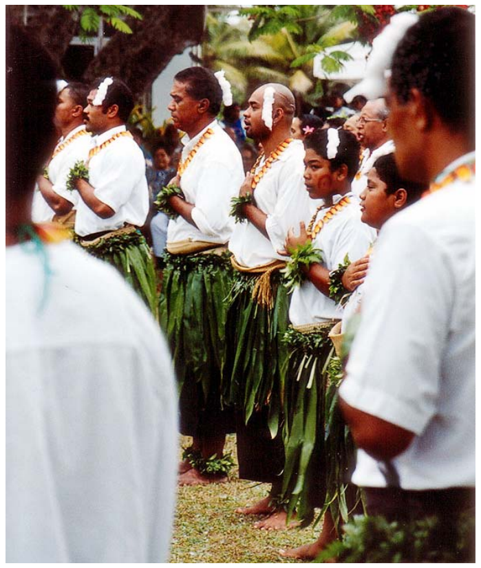
Welcoming ceremonies at Niue Island