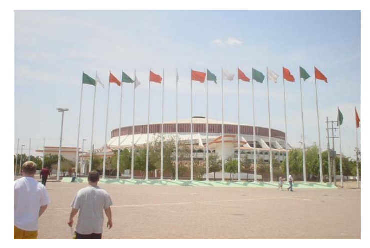
The competition venue at Hermosillo