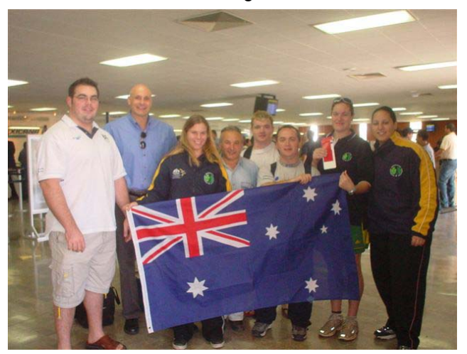
The Australian Team, flying the flag