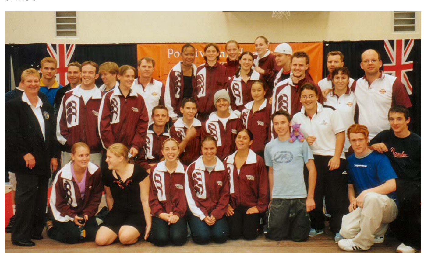
The Queensland Under 16 & Under 18 Team