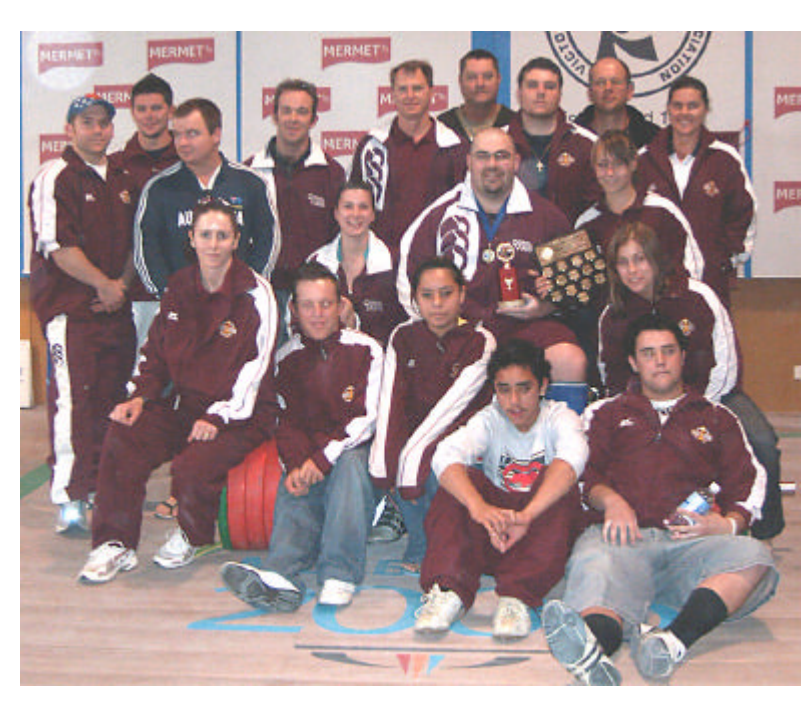
Queensland Team at the 2006 National Open & 20 Championships